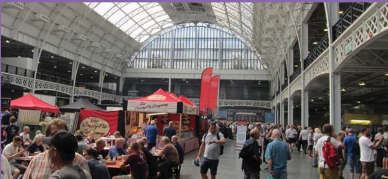
Left: The festival occupied the majority of the Olympia venue, the photo shows the Olympia National area