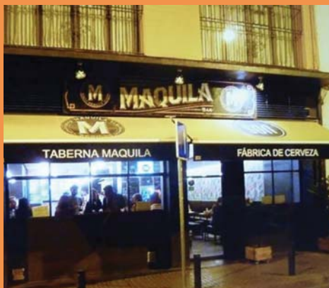
Taberna Maquila brew-pub, Seville

It offers a good range of bottled Spanish craft beers and a rotating selection of local draught beers. We sampled Cantabrian brewer DouGall's finely balanced Pale Ale and a foamy Cartujana APA. A short distance away is one of the best beer cafés in town, the Maquila bar, on Calle Delgado. This is the only true brew-pub in town, who brew a range of Son beers, most of which are available on draught. Other draught beers are available from regional brewers, and the impressive food menu offers tasty food with a distinctly Andalusian touch. We certainly enjoyed the Son Black Catrina.